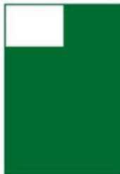
EIGHTH 66mm w x 46.5mm h