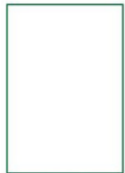
FULL 148mm w x 210mm h + 3mm bleed