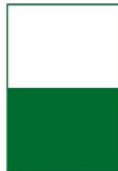
HALF 136mm w x 96mm h