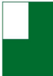
QUARTER 66mm w x 96mm h